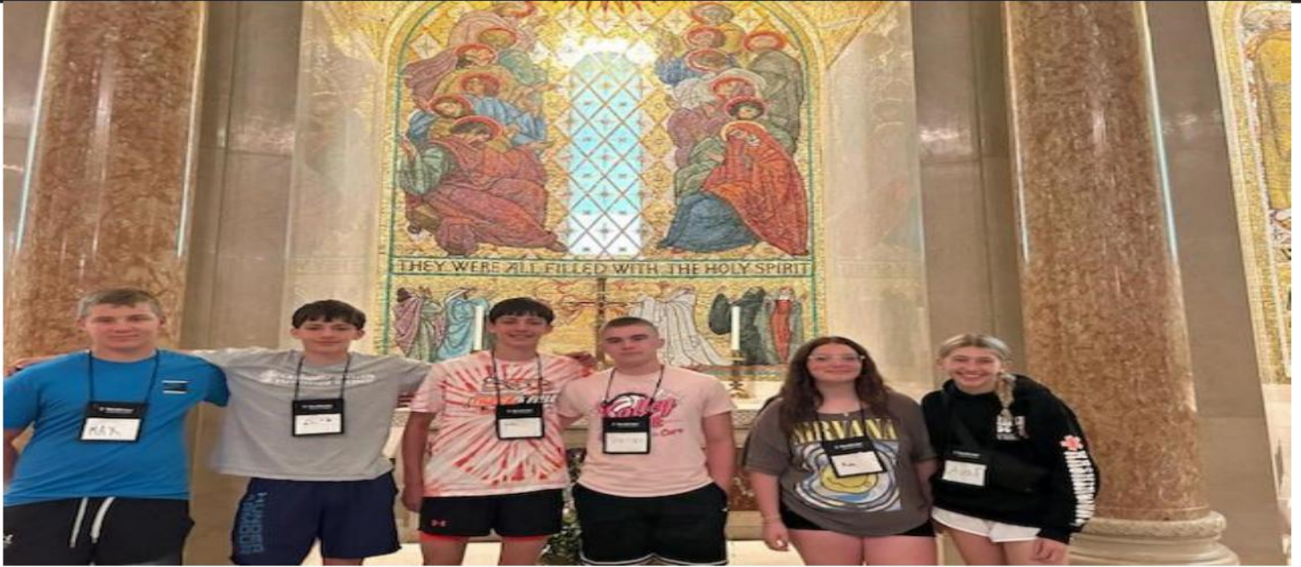
Our Grade PSR students visiting the Basilica in Washington D.C.