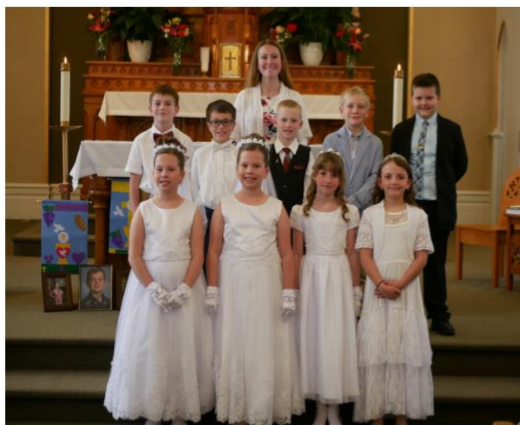
1 st Communion 2023